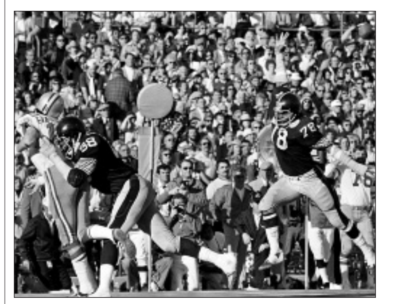
Pittsburgh's "Steel Curtain" defense forced Cowboys' guarterback Roger Staubach into throwing three interceptions in the Steelers' Super Bowl X